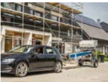
Can be driven with driving licence class B