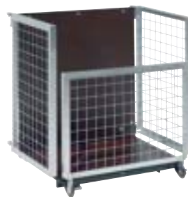
Universal platform comfort 70 x 44 x 70 cm