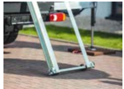
Ground-level loading possible thanks to infinitely extendible lower extension.