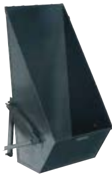
Tilting bucket 80 litre (for tilting carriage only)