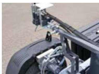
Interlocking, high-performance self-propelled drive (optional)