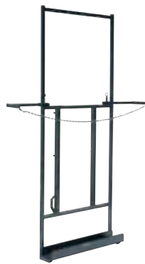
Sheet platform 90 x 15 x 220 cm