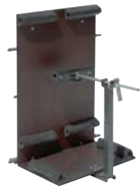
Solar platform standard