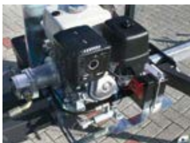
Petrol engine with electric starter (optional)