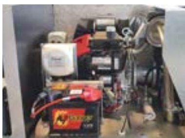
Powerful Honda engines ensure maximum performance values