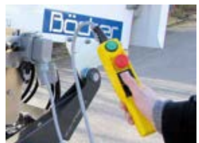
Operation below via operating buttons with 4 m cable