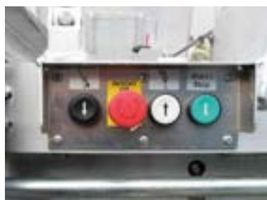
Operation above at the head