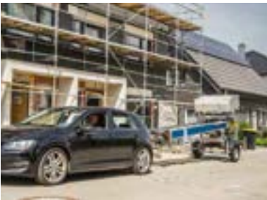
Can be driven with driving licence class B