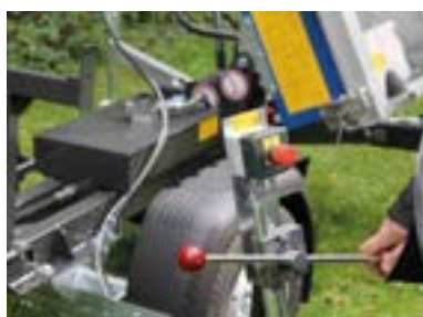
Mechanical remote control

The Böcker Junior G scaffolding lift is the result of decades of experience in the sector of construction lifts. With its small dimensions and minimal required space, it was developed specifically for the use on narrow construction sites. Thanks to its low dead weight the lift can be pulled by almost any passenger car.