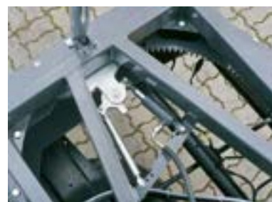
Optional hydraulic live ring adjustment