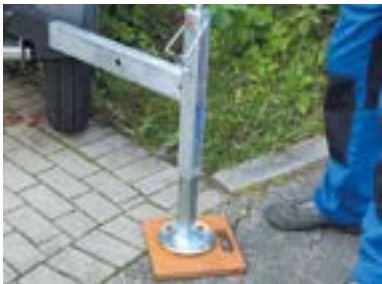
Installation also on uneven ground