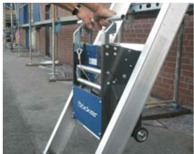
Easy installation of drive unit