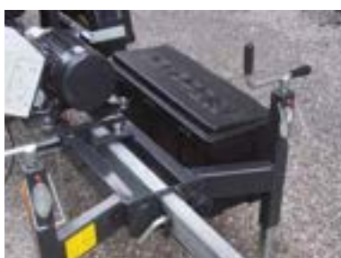
Large lockable toolbox