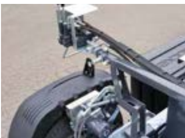
Powerful manoeuvring drive (optional)