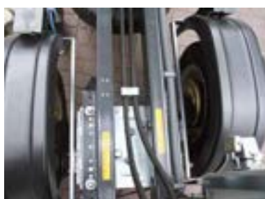
Retractable axle, manoeuvring width 0.89 m (optional)