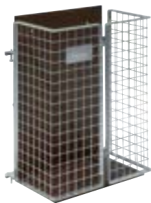
Universal platform 60 x 35 x 85 cm with protection grating