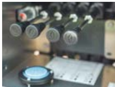
Control stand of hydraulic outriggers