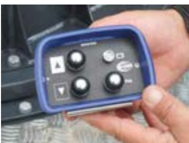
Optional mode by remote control