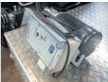
Additional 230 V electric motor (optional)