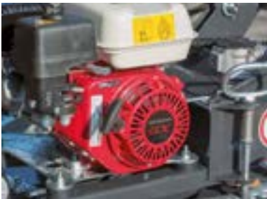
Powered by strong petrol engine or electric motor