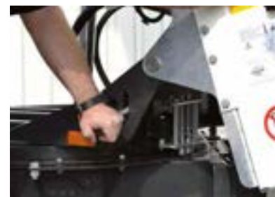
Adjustable turntable with mechanical lock release mechanism