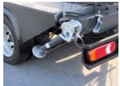
Hydraulic outriggers mechanically extendable and 60° swivelling