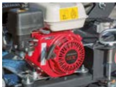
Powered by strong petrol engine or electric motor