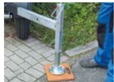
Installation also on uneven ground