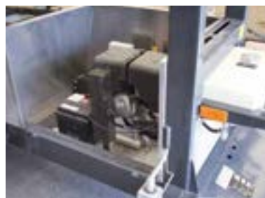
Fuel-efficient Honda petrol engine with large tank