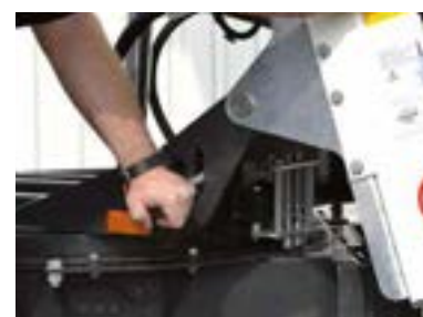
Adjustable turntable with mechanically releasable lock