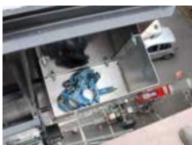
Platform equipped with storage trays for small parts