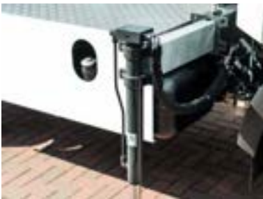
Optional front hydraulic outriggers pull-out