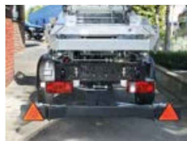
Integrated and protected lights