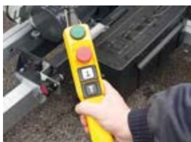
Electrical operation with creep speed (optional)