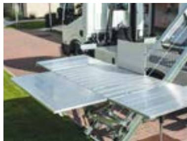
Large and flat loading surface on the platform