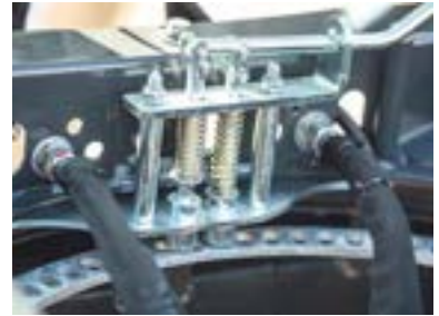
Infinitely adjustable turntable with mechanically releasable lock

The Agilo offers a large range of serial and optional equipment. E.g., the serial equipment includes hydraulic outriggers and an extendible lower extension ensuring a low loading height. The flat furniture platform takes up even bulky removal items thanks to its large surface. Its lateral flaps are foldable by 90° or 180° and can even be detached. As an option we offer rotatable and extendible platforms and platforms with an infinitely adjustable spindle easing an absolutely horizontal furniture transportation.