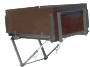
Platform 60 x 85 x 35 cm with side-flaps